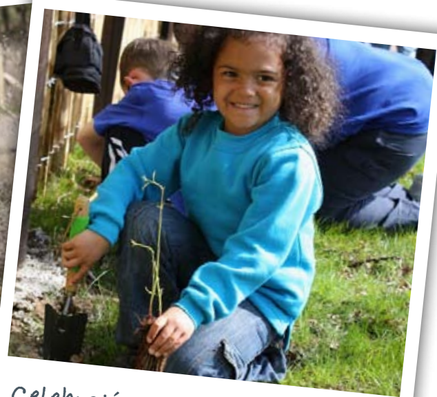
Celebrating St. George's Day

Basildon Beavers celebrated St George's Day with their annual Group fun day and despite the overcast weather and threat of rain, planted 250 hedging plants at Kingston Ridge after a short promise renewal ceremony.