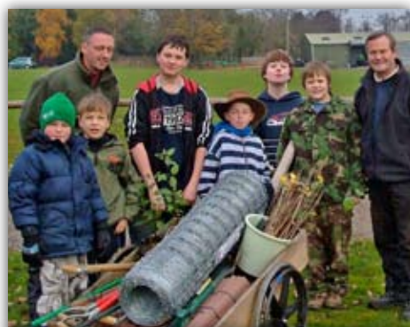
As part of the Scout centenary Stansted Scouts went to Skreens Park to plant 30 trees donated by the Woodland Trust.

A follow-up development day is being organised for June 2008; watch this space for details!